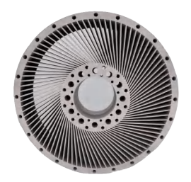
Impeller IN718 Φ 380 x 156 mm